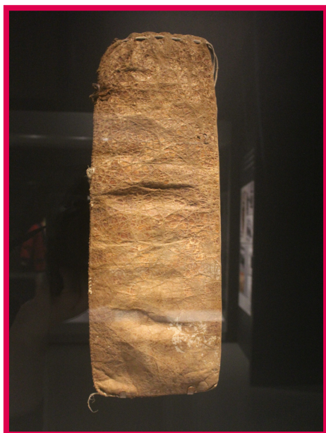
Corn Storage Bag (isk?asi:r?a). c. 1909.