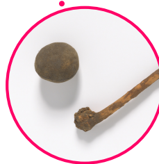
Object: Stick and Ball (detail)