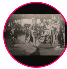
Panel: Wichita Powwow Dancers