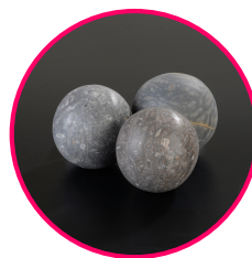
Object: Marbles (ᐱᓵᓴᐁᐱ)