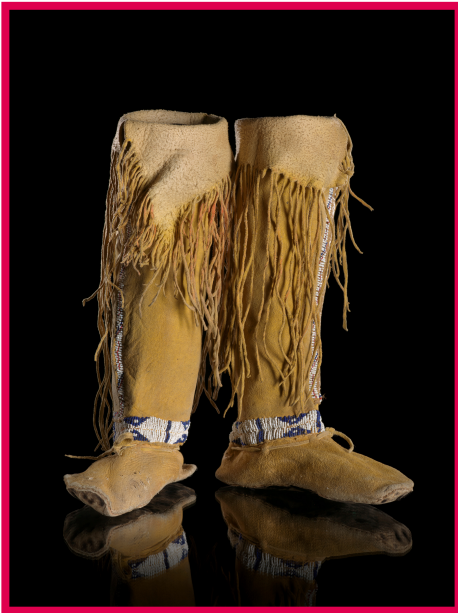
Girl's Leggings (ya kok xon ha-way). c. 1914.