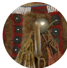
Object: Fur Hat (detail)