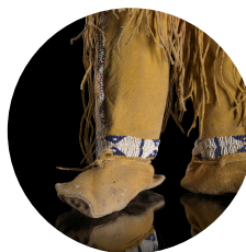
Object: Girl's Leggings (detail)