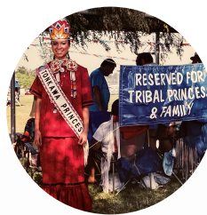
Panel: Tonkawa Tribal Powwow

FAM curatorial staff collaborated with Tonkawa tribal leaders to select these representative objects and interpretive materials.