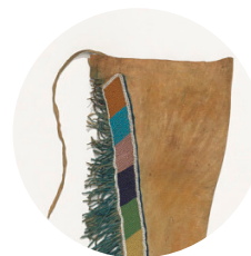
Object: Boy's Leggings (detail)