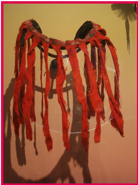
Stickball Game Necklace (enockv), c. 1908-1910.