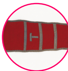
Object: Stickball Breechcloth