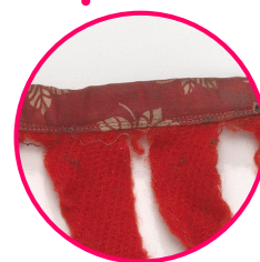
Object: Stickball Game Necklace (detail)