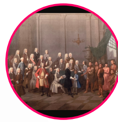
Panel: Delegation of Creek Indians