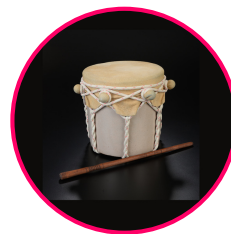
Object: Crock Drum