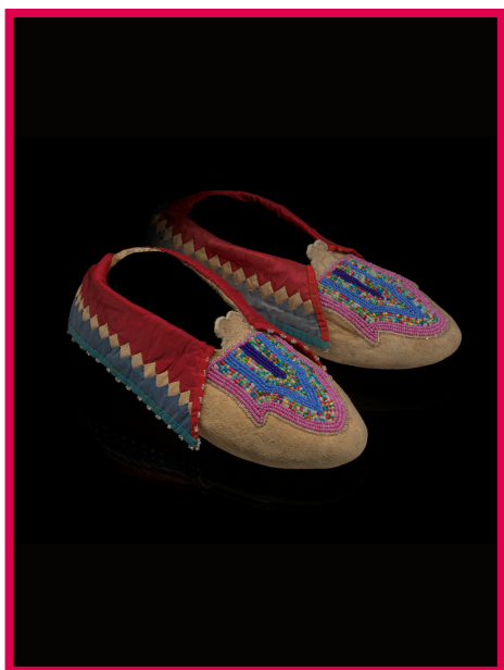
Moccasins (ta ha ho n -be). c. 1908.