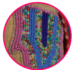
Object: Moccasins (detail)