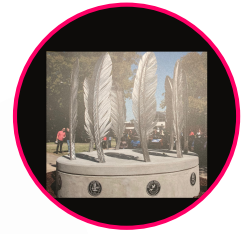
Panel: Monument dedicated to Nine Federally Recognized Tribes