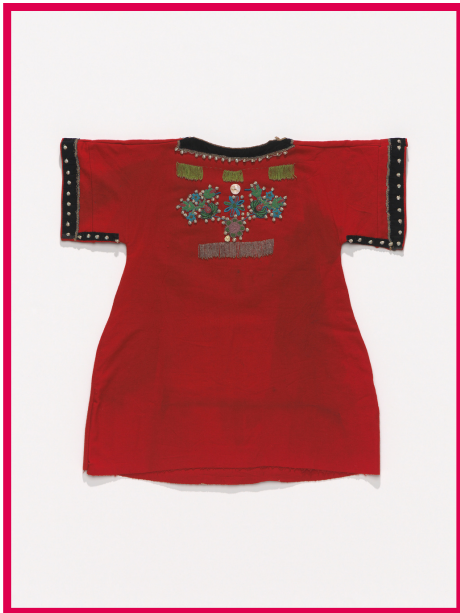
Girl's Dress (kwezenhs gdagiigini mchigodenh), c. 1888-1919.