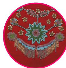
Object: Girl's Dress