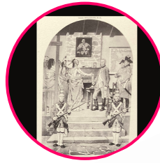
Panel Conspiracy of Pontiac

FAM curatorial staff collaborated with Ottawa tribal leaders to select these representative objects and interpretive materials.