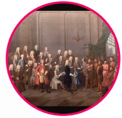
Panel: Delegation of Creek Indians