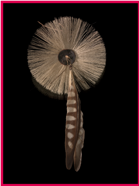
Man's Hair Ornament (kvsplikv). c. 1913.