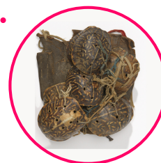
Object: Turtle Shell Leg Rattle