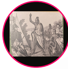
Panel: A Treaty with the Creeks

FAM curatorial staff collaborated with Kialegee tribal leaders to select these representative objects and interpretive materials.