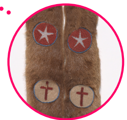
Panel: Otter Collar (detail)