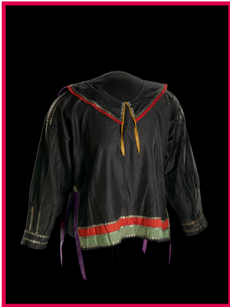
Woman's Blouse (ókilòxla). c. 1913. Located in the Creation section of WINIKO: Life of an Object.