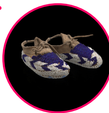
Panel: Baby's Moccasins