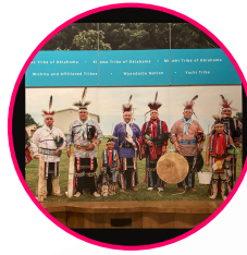
Panel: Kaw Iloshka Committee

FAM curatorial staff collaborated with Kaw tribal leaders to select these representative objects and interpretive materials.