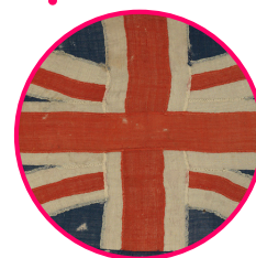
Object: British Flag (detail)