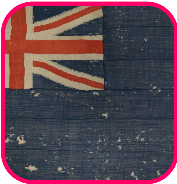
British Flag (nim'hika) (detail). c. 1961.