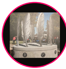
Panel: Monument dedicated to Nine Federally Recognized Tribes

FAM curatorial staff collaborated with Eastern Shawnee tribal leaders to select these representative objects and interpretive materials.