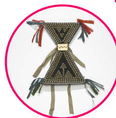
Object: Woman's Hair Ornament