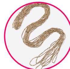
Object: Wampum Necklace