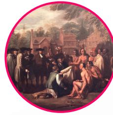
Panel: Penn's Treaty with the Indians

FAM curatorial staff collaborated with Delaware Tribe of Indians tribal leaders to select these representative objects and interpretive materials.