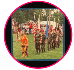
Panel: Lenape Color Guard