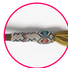
Object: Native American Church Gourd Rattle (detail)