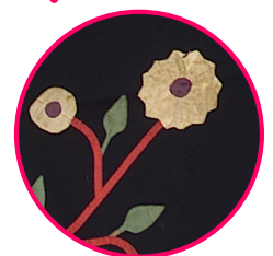
Object: Ribbonwork Blanket (detail)