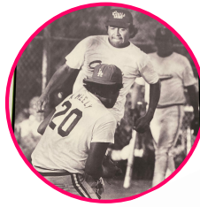
Panel: Caddo Springs Base Runner

FAM curatorial staff collaborated with Caddo tribal leaders to select these representative objects and interpretive materials.