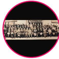
Panel: National Congress of the American Indians Group Photo