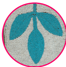
Object: Bandolier Bag (Detail)