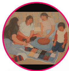
Panel: Shawnees Playing Dice

FAM curatorial staff collaborated with Shawnee tribal leaders to select these representative objects and interpretive materials.