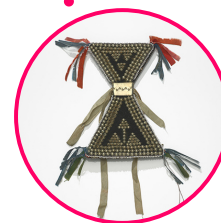
Object: Woman's Hair Ornament