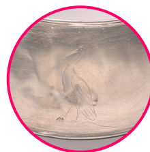
Object: Crescent Gorget Necklace (Detail)