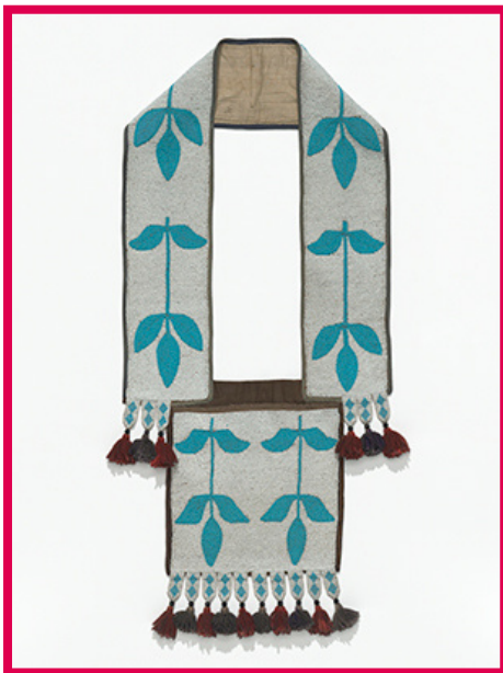
Bandolier Bag (pech'wa pitaka). c. 1921