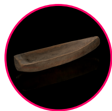
Object: Ice Slider