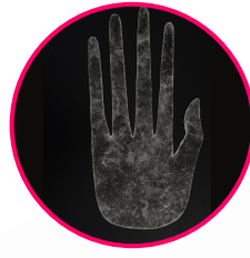
Object: Hopewell Hand (Replica)

FAM curatorial staff collaborated with Seneca-Cayuga tribal leaders to select these representative objects and interpretive materials.