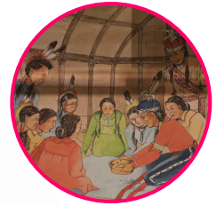
Panel: The Bowl Game