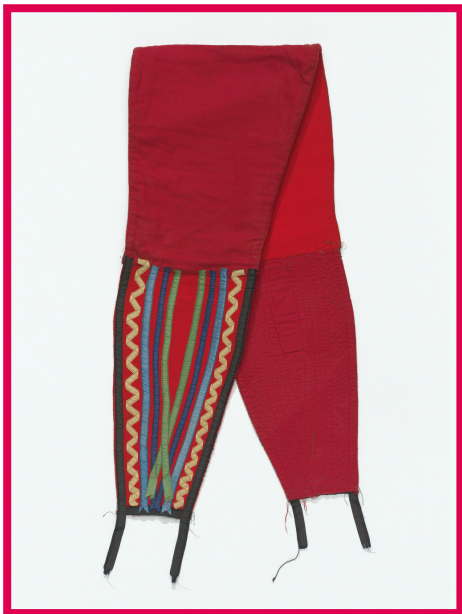
Breechcloth (takhvkv). c. 1909.