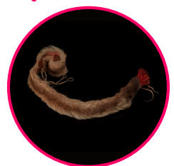
Object: Stickball Game Tail