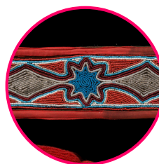
Object: Sash (detail)