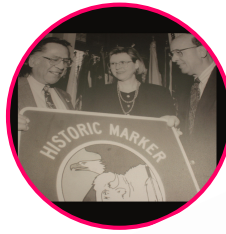
Panel: Senator Kelly Haney

FAM curatorial staff collaborated with Seminole tribal leaders to select these representative objects and interpretive materials.