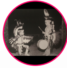
Panel: 5-year old powwow performers

FAM curatorial staff collaborated with Ponca tribal leaders to select these representative objects and interpretive materials.