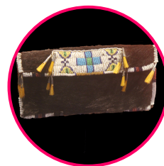
Object: Sewing Bag