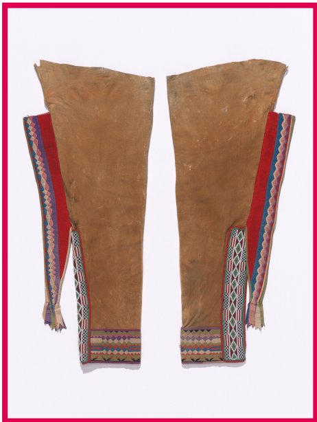
Man's Leggings (há'utà). c. 1853-1929.