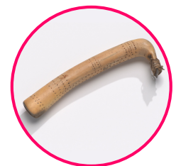
Object: Hide Scraper