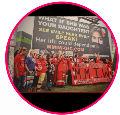
Panel: "What If She Was Your Daughter?"