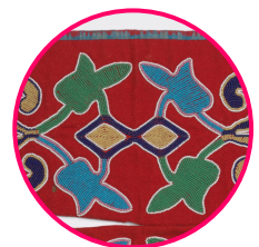
Object: Horse Crupper (detail)