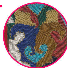
Object: Man's Turban (detail)