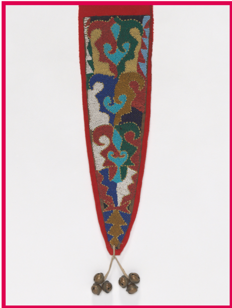
Man's Turban (hjingibrj wogrange). c. prior to 1965.