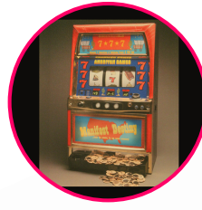
Panel: Tools of the Trade

FAM curatorial staff collaborated with Otoe-Missouria tribal leaders to select these representative objects and interpretive materials.