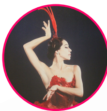
Panel: Ballerina Maria Tallchief

FAM curatorial staff collaborated with Osage tribal leaders to select these representative objects and interpretive materials.