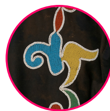
Object: Man's Coat (detail)