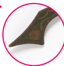
Object: War Club (Detail)