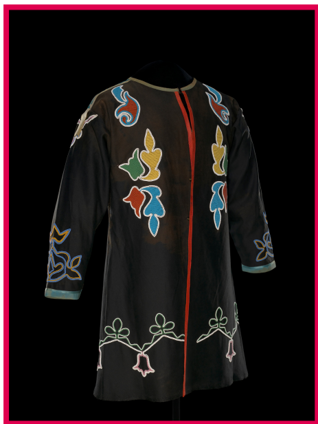
Man's Coat. c. 1908.