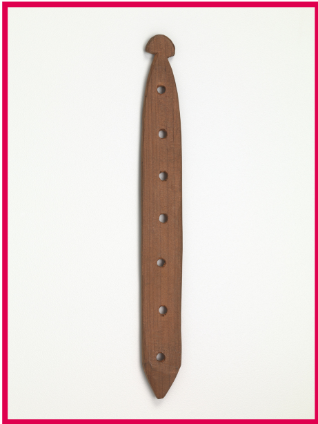
Calendar Stick (kohv). c. 1910.