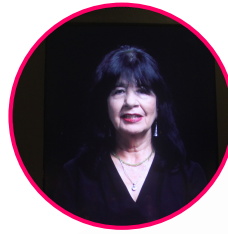
Panel: Poet Laureate Joy Harjo

FAM curatorial staff collaborated with Muscogee tribal leaders to select these representative objects and interpretive materials.