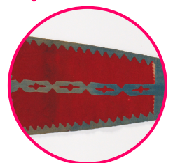
Object: Stickball Breechcloth (detail)