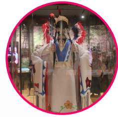
Object: Women's Fancy Shawl Regalia