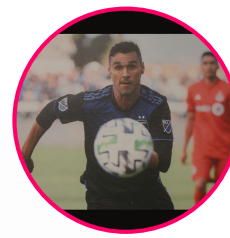
Panel: Chris Wondolowski (Kiowa) of the San Jose Earthquakes