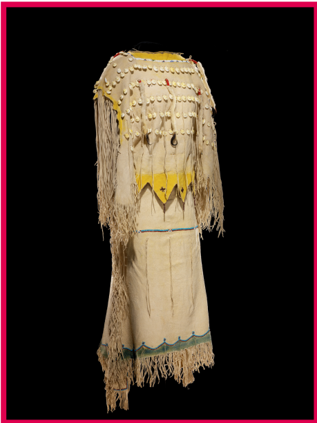
Woman's Buckskin Dress (qócauizòhòldà). c. 1909.