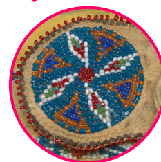
Object: Man's Moccasins (detail)