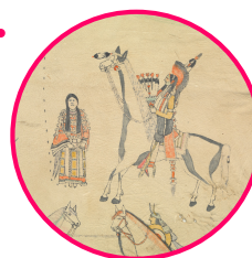
Object: Hide Calendar (Detail)