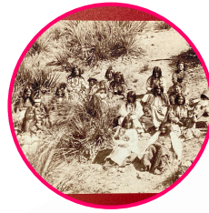
Panel: Apache women and children

FAM curatorial staff collaborated with Ft. Sill Apache tribal leaders to select these representative objects and interpretive materials.