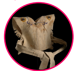
Object: Child-carrying jacket