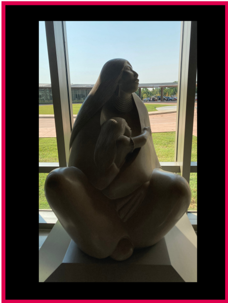
Allan Houser (Fort Sill [Chiricahual Apache]). Earth Mother. 1980.