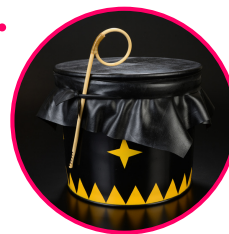
Object: Water Drum