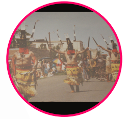
Panel: Ft. Still Apache Mountain Spirit dancers