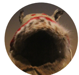
Object Child's Coat (detail)