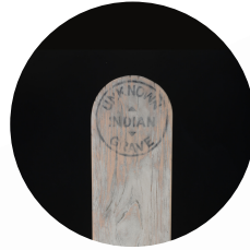
Panel: Replica US Calvary Indian Grave Marker (Detail)

FAM curatorial staff collaborated with Comanche tribal leaders to select these representative objects and interpretive materials.