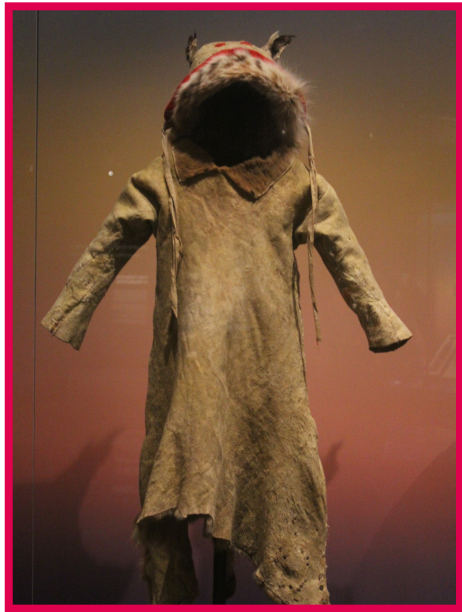
Child's Coat (tue?tutsi pia kwasu). c. 1909.