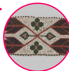
Object: Strap (detail)