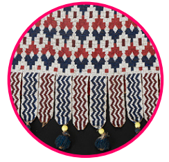
Object: Bandolier Bag (detail)