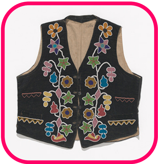
Man's Vest (bébisya-gishknegwéyyan). c. 1910. Courtesy of National Museum of the American Indian, Smithsonian Institution.