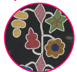
Object: Man's Vest (detail)