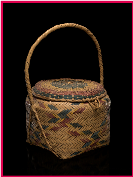
Basket with Cover (tvpushik micha isht ompohulmo). c. 1910.