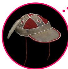
Object: Stickball Cap