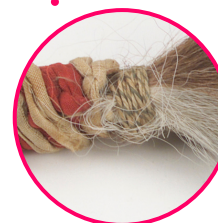
Object: Stickball Game Tail (detail)