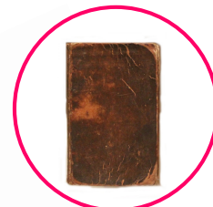
Object: Sophia Pitchlynn's Choctaw Bible