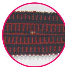
Object: Sash (detail)