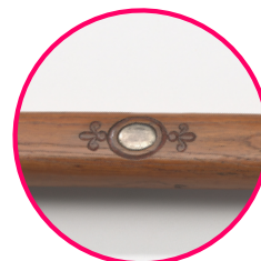
Object: Pipe Tomahawk (Detail)