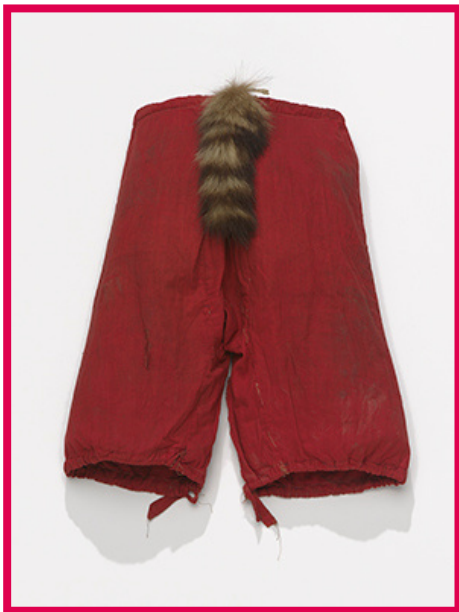
Stickball Player's Pants (to'li' imbalaafokha), c.1908-1910.