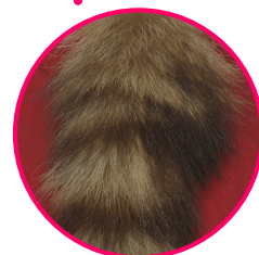
Object: Stickball Players Pants (Detail)