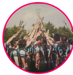
Panel: Chickasaw Stickball Tournament

FAM curatorial staff collaborated with Chickasaw tribal leaders to select these representative objects and interpretive materials.