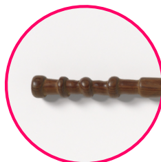
Object: Cane (detail)