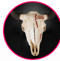
Object: Cooper Site Bison Skull (Replica)