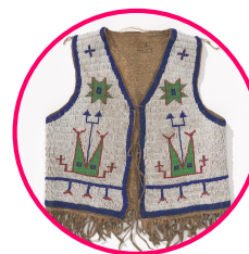
Object: Boy's Vest