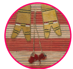
Object: Backrest (Detail)