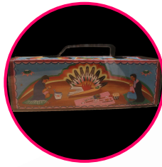
Object: Native American Church Box Set

FAM curatorial staff collaborated with Cheyenne & Arapaho tribal leaders to select these representative objects and interpretive materials.