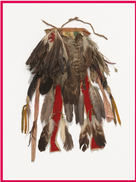
Dance Bustle (co'ookoo3) c. prior to 1910.