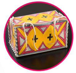
Object: Cheyenne Parfleche