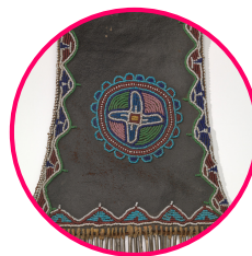
Object: Belt Bag (detail)