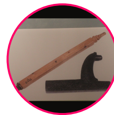
Panel: Kiowa Apache Horse Effigy Pipe