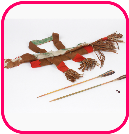
Toy quiver and arrows (k'á k'aret, k'á), c. 1909. Located in the Continuum section of WINIKO: Life of an Object.