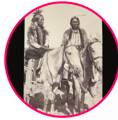
Panel: Apache Sports

FAM curatorial staff collaborated with Apache tribal leaders to select these representative objects and interpretive materials.