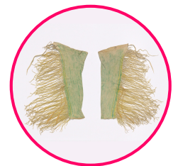
Object: Man's Leggings