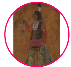
Object: Tobacco Bag (Detail)