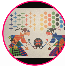
Panel: blessings from above and below