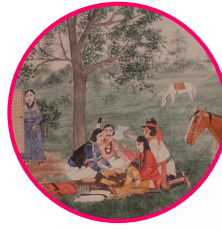
Panel: Moccasin Game (Detail)

FAM curatorial staff collaborated with Absentee Shawnee tribal leaders to select these representative objects and interpretive materials.