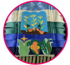
Object: Drawstring Bag (detail)